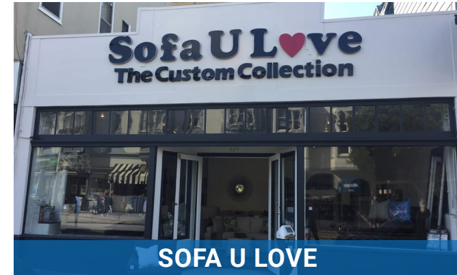
SOFA U LOVE