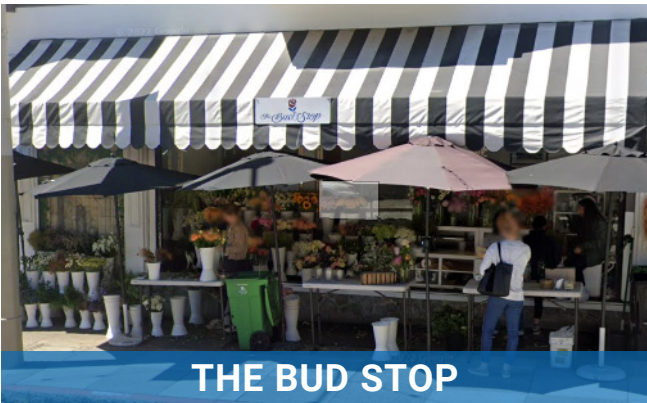
THE BUD STOP