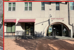
1420 SAN LEANDRO BLVD