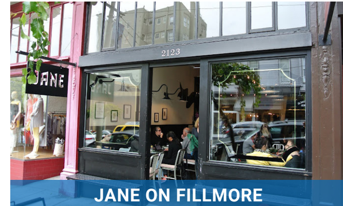
JANE ON FILLMORE