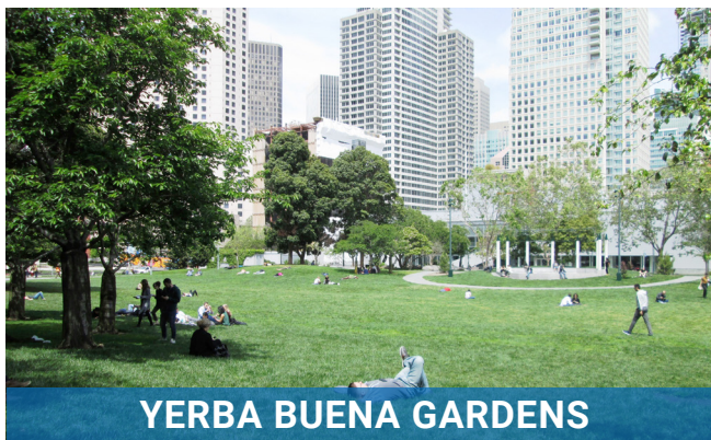
YERBA BUENA GARDENS