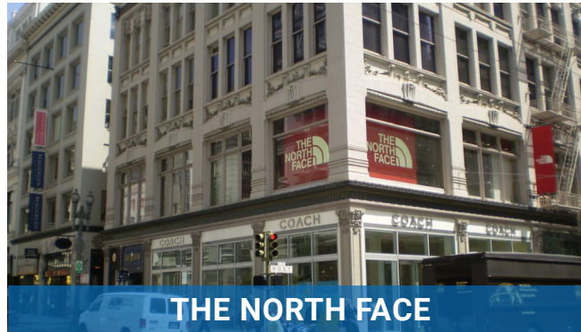
THE NORTH FACE