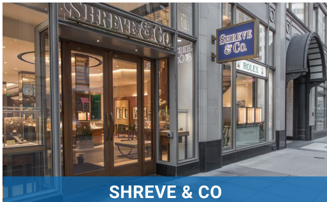
SHREVE & CO