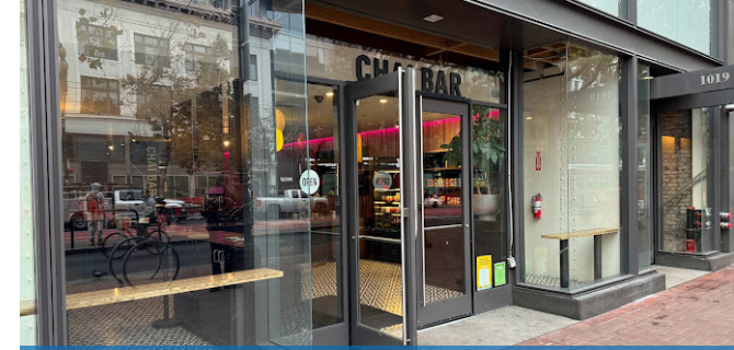
DAVID RIO CHAI BAR