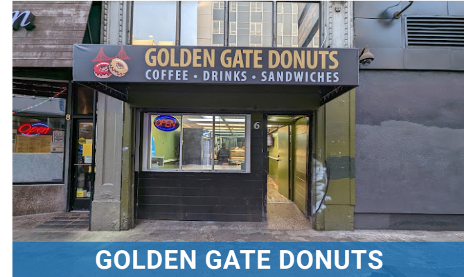
GOLDEN GATE DONUTS