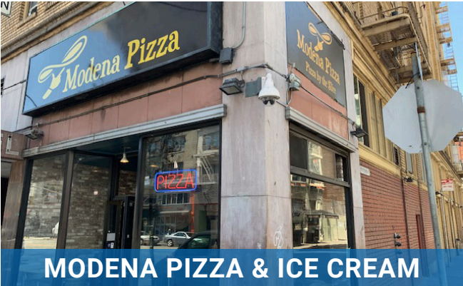
MODENA PIZZA & ICE CREAM