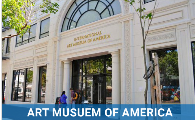
ART MUSEUM OF AMERICA