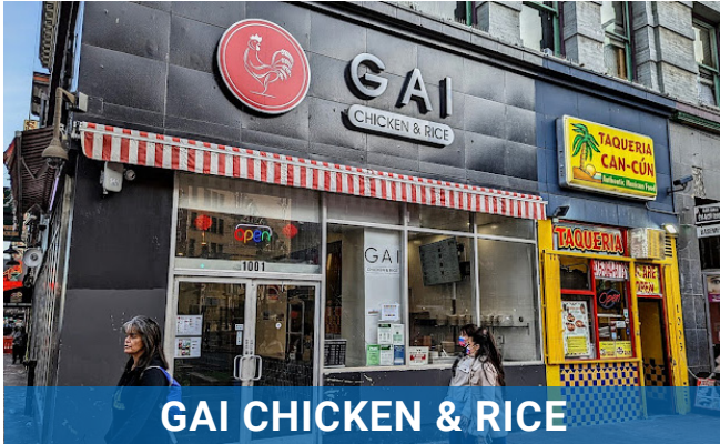
GAI CHICKEN & RICE