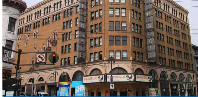
GOLDEN GATE THEATRE