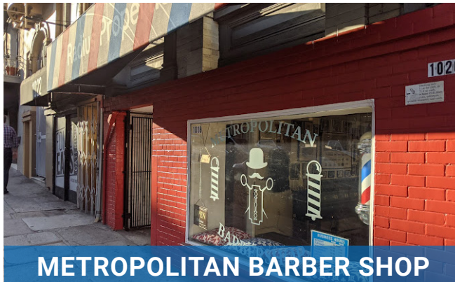
METROPOLITAN BARBER SHOP