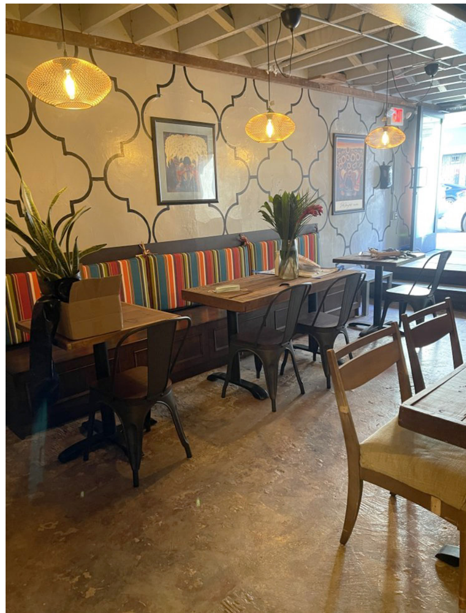
*Photo is not current taken and does not represent the current condition of the space.

Don't Miss Out on this Superb Opportunity!