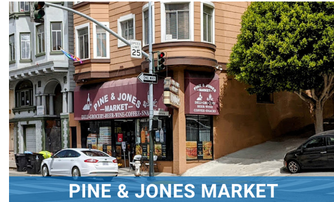
PINE & JONES MARKET