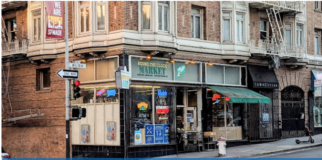
ROUND THE CLOCK MARKET