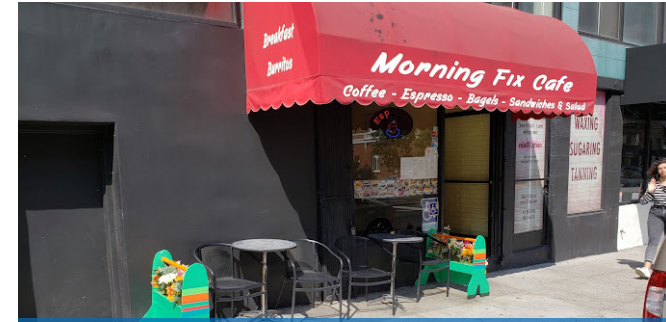
MORNING FIX CAFE