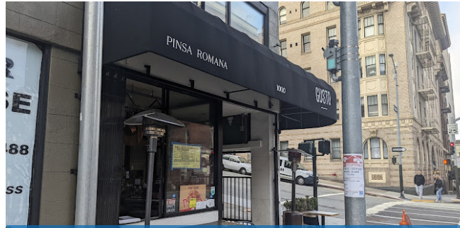
GUSTO PINSA ROMANA