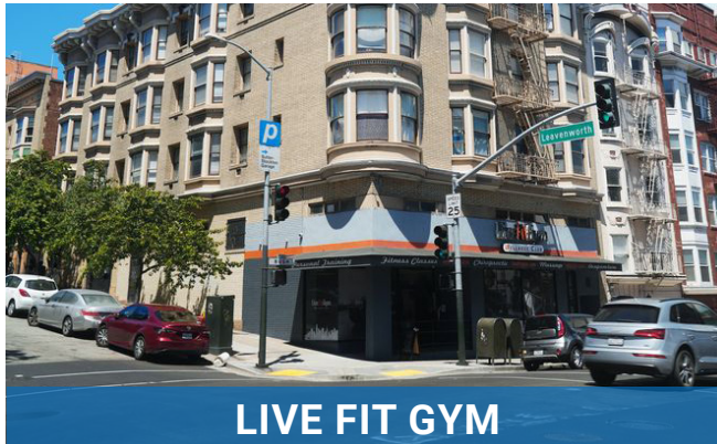
LIVE FIT GYM