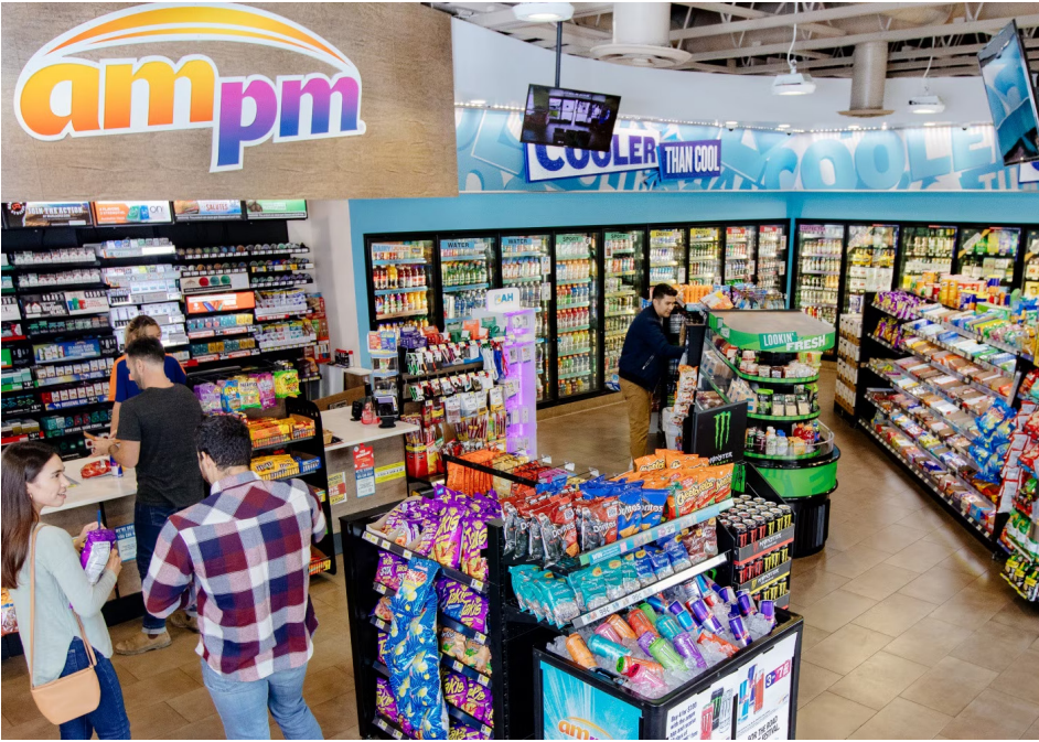
Not Photos of Subject Property

Forty years ago, the ampm mini market franchise was launched. The ampm franchise is owned by BP West Coast Products, and Treasure Franchise is the exclusive master franchisor in Nevada, Arizona and part of California. Today there are over 1000 ampm franchise locations in the states of Arizona, California, Nevada, Oregon and Washington.