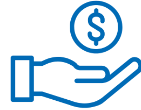
Per Capita Income