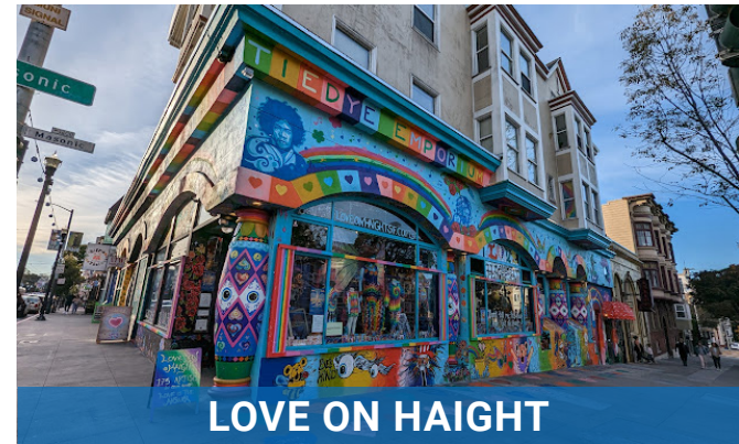
LOVE ON HAIGHT