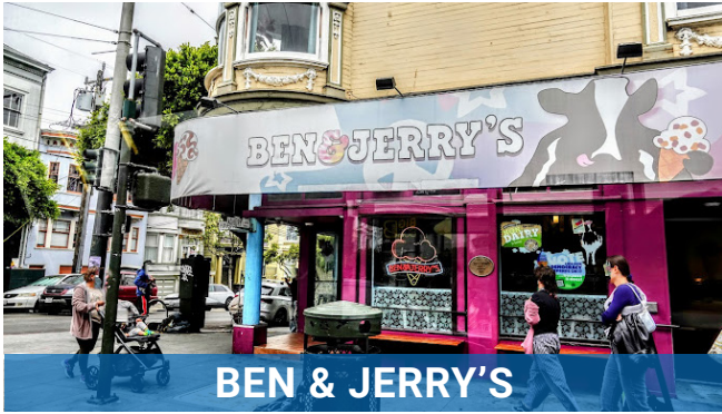
BEN & JERRY'S