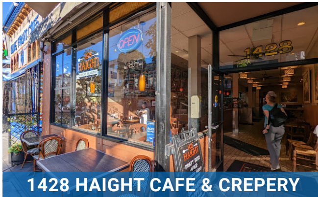
1428 HAIGHT CAFE & CREPERY