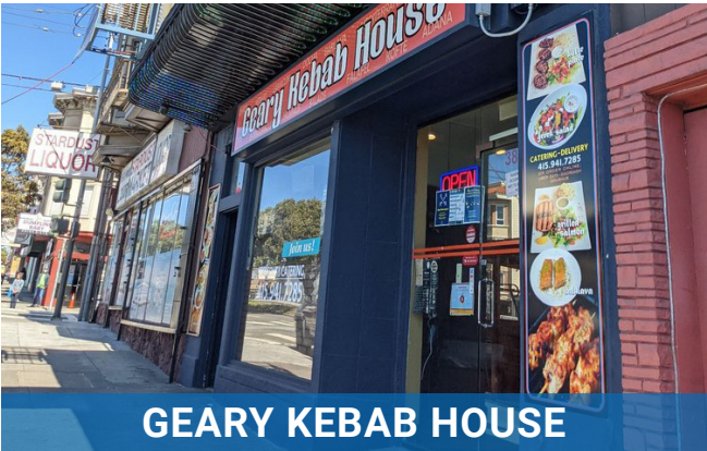
GEARY KEBAB HOUSE