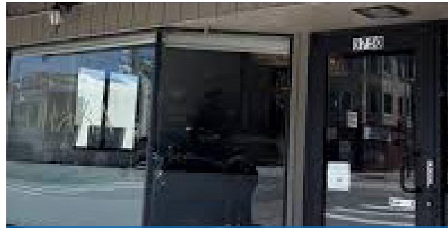
ORAAAN THAI EATERY