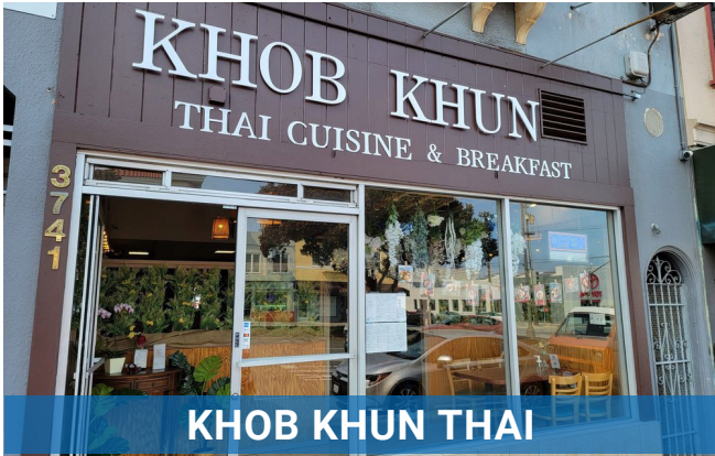
KHOB KHUN THAI