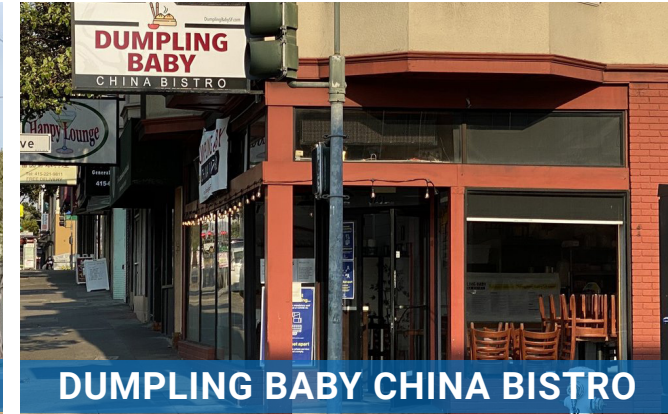
DUMPLING BABY CHINA BISTRO