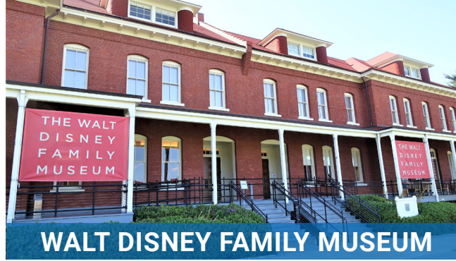
WALT DISNEY FAMILY MUSEUM