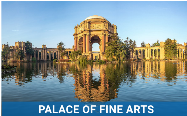
PALACE OF FINE ARTS