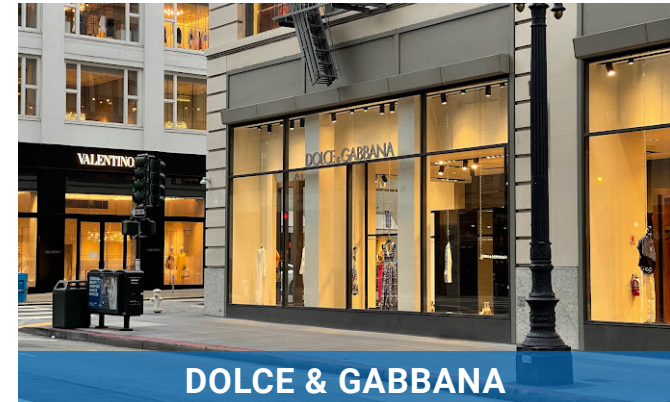
DOLCE & GABBANA