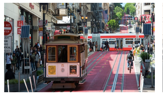
POWELL CABLE CAR LINE