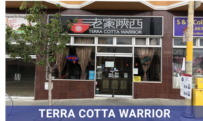
TERRA COTTA WARRIOR