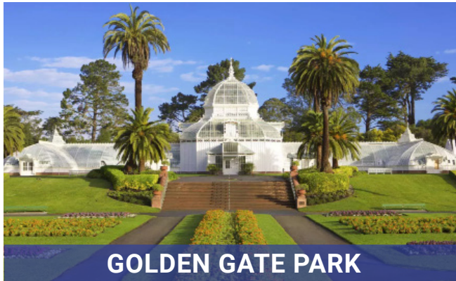
GOLDEN GATE PARK