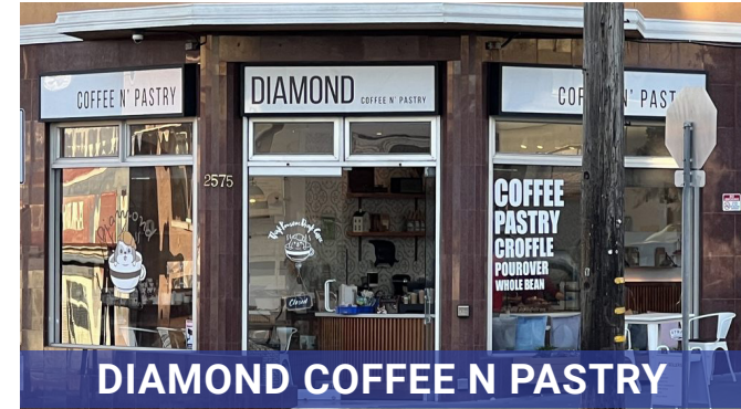
DIAMOND COFFEE N PASTRY