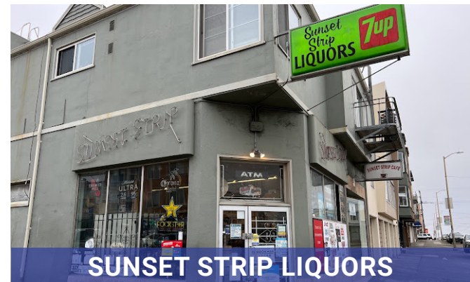
SUNSET STRIP LIQUORS