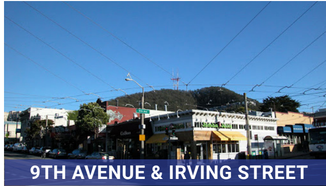
9TH AVENUE & IRVING STREET