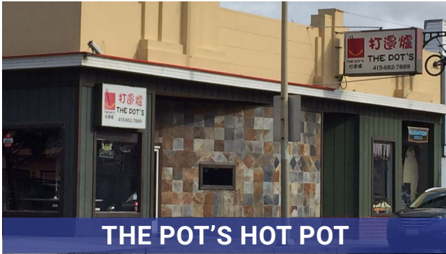
THE POT'S HOT POT