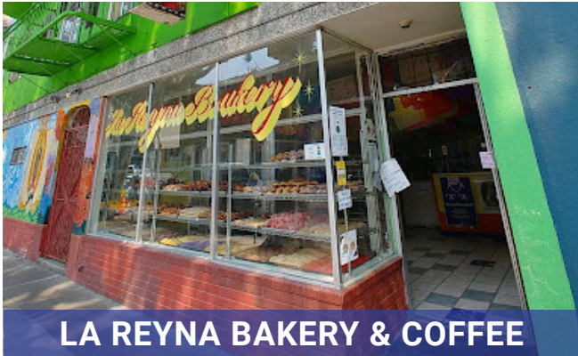
LA REYNA BAKERY & COFFEE