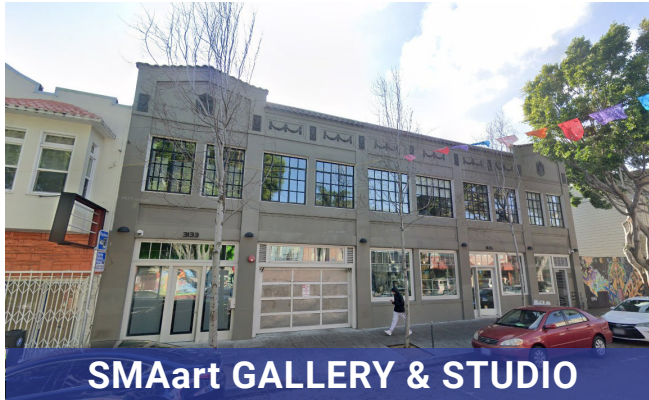
SMArt GALLERY & STUDIO