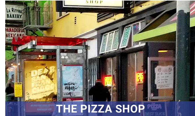
THE PIZZA SHOP