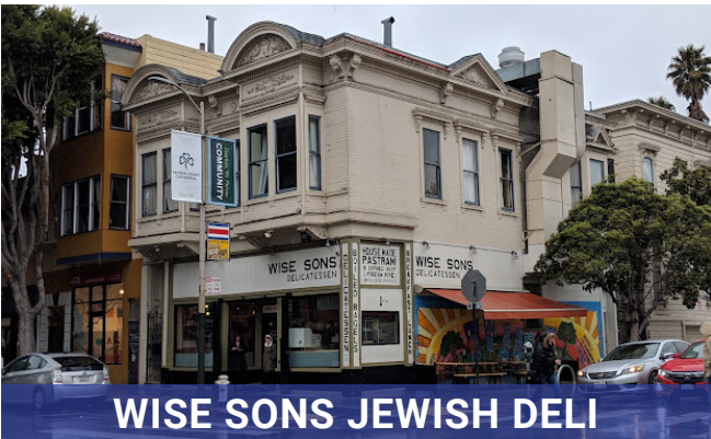
WISE SONS JEWISH DELI