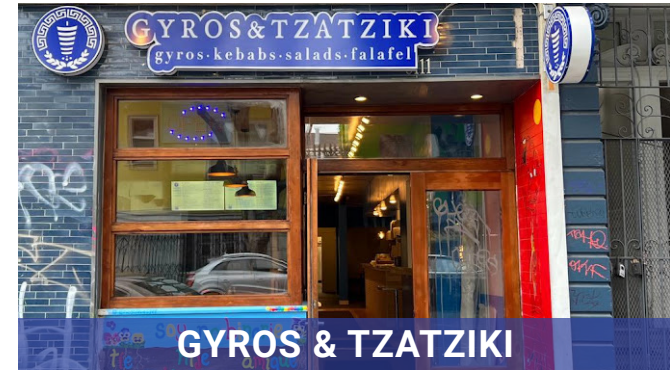
GYROS & TZATZIKI