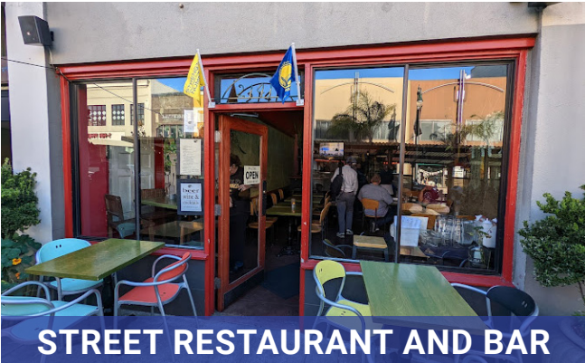
STREET RESTAURANT AND BAR