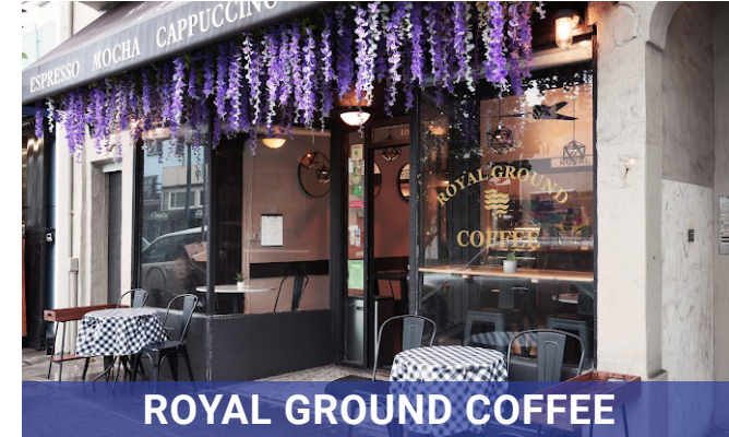
ROYAL GROUND COFFEE