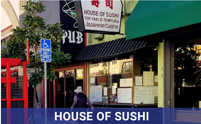
HOUSE OF SUSHI