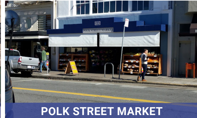
POLK STREET MARKET