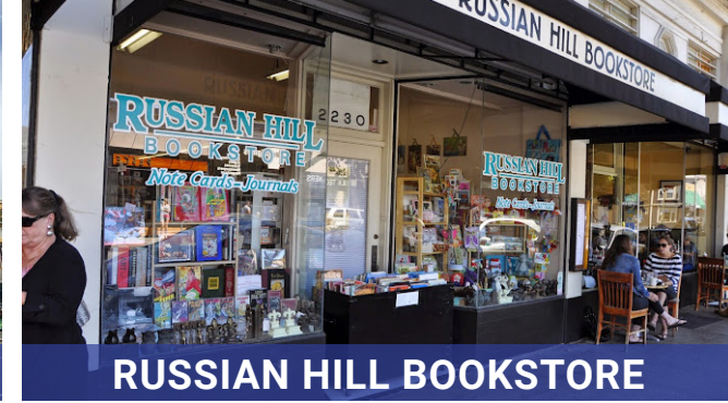
RUSSIAN HILL BOOKSTORE