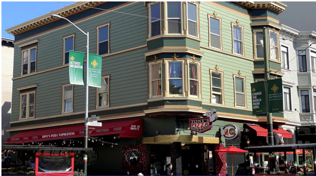
TONY'S PIZZA NAPOLETANA