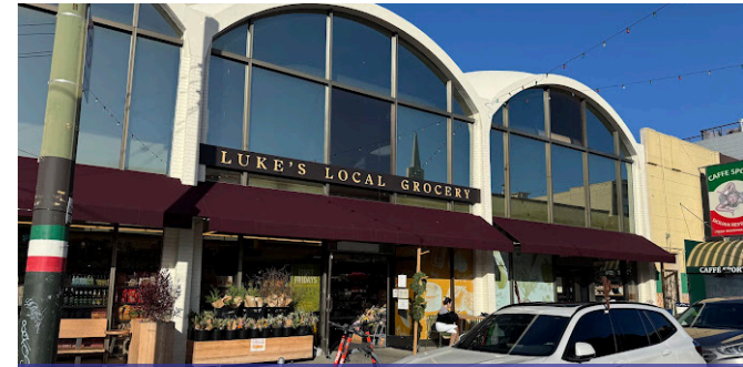
LUKE'S LOCAL GROCERY