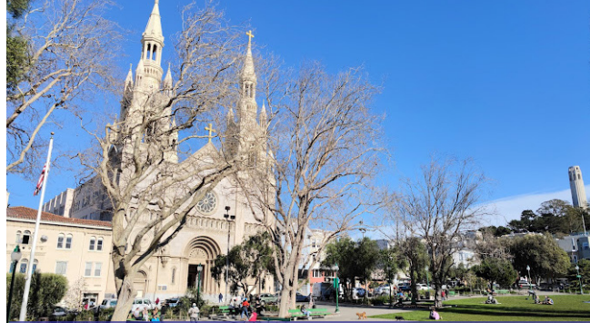
WASHINGTON SQAURE PARK