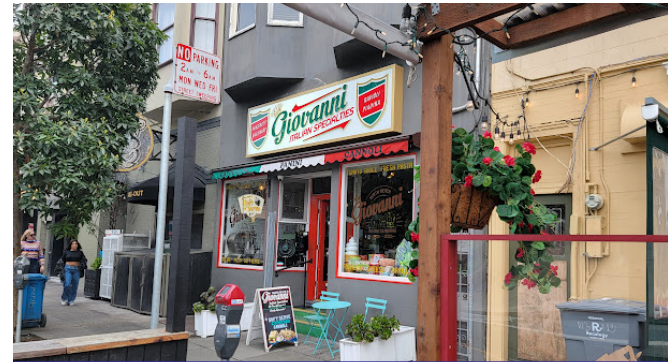
GIOVANNI ITALIAN SPECIALTIES