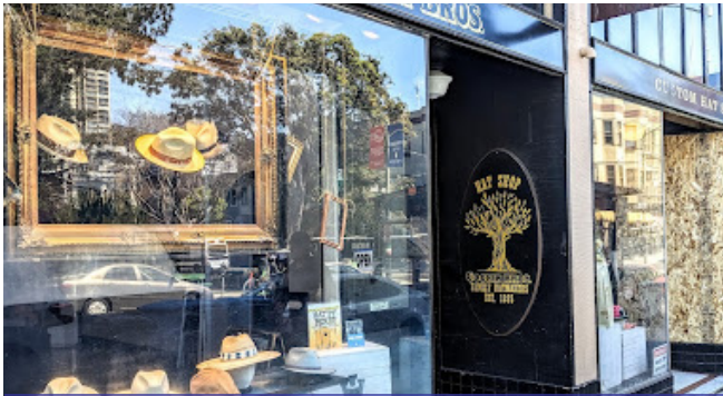
GOORIN BROS. HAT SHOP