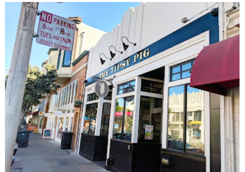
THE TIPSY PIG