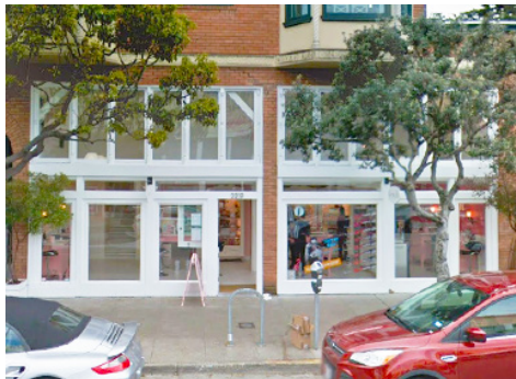
BENEFIT COSMETICS BOUTIQUE/BROWBAR