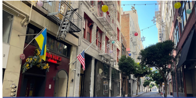
IRON HORSE COCKTAILS