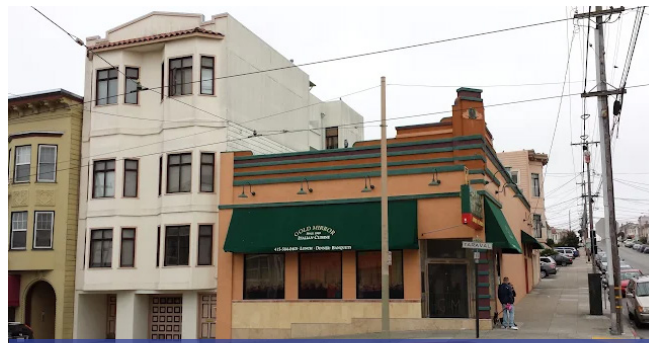
THE GOLD MIRROR