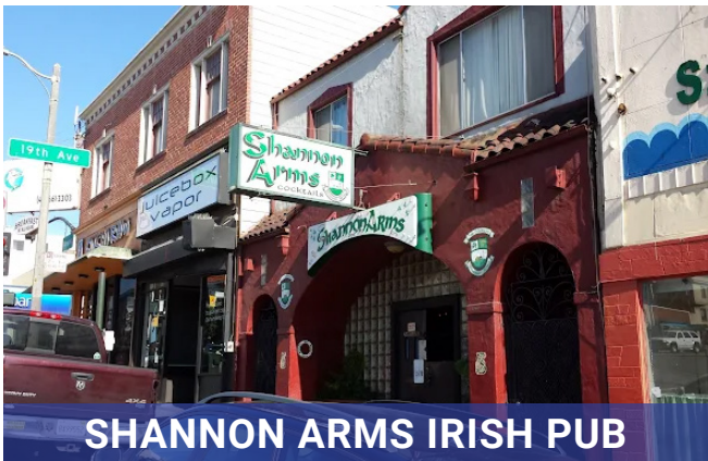
SHANNON ARMS IRISH PUB