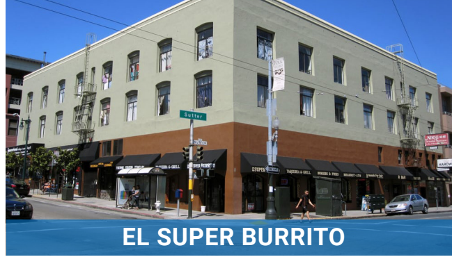
EL SUPER BURRITO