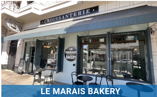
LE MARAIS BAKERY