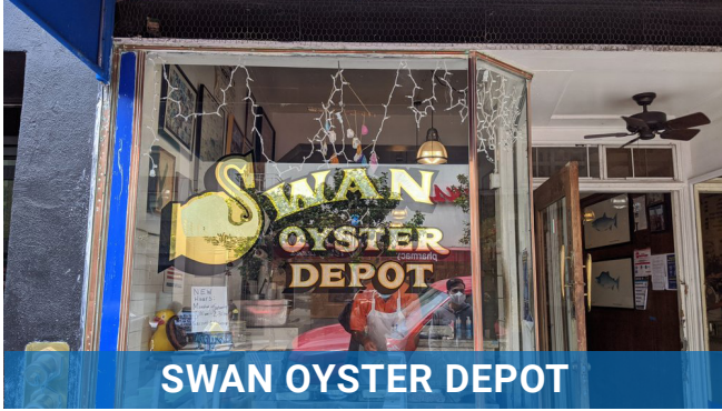
SWAN OYSTER DEPOT