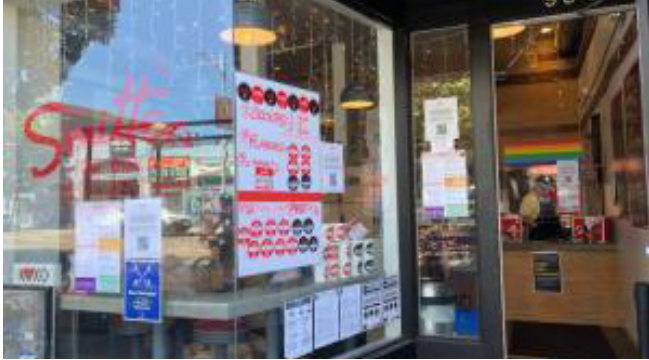
SMITTEN ICE CREAM