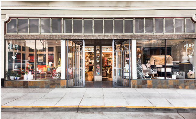
ALDEA HOME & BABY