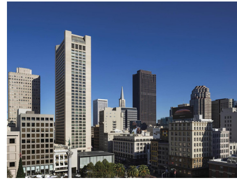
GRAND HYATT HOTEL