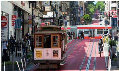
POWELL CABLE CAR LINE