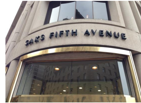
SAKS FIFTH AVENUE