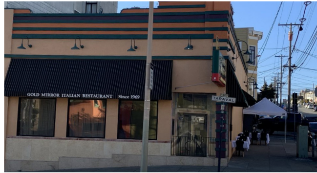
THE GOLD MIRROR ITALIAN