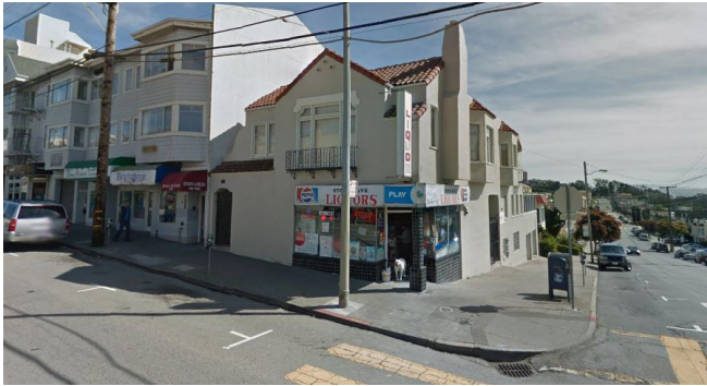
STOP & SAVE LIQUOR