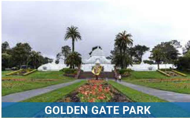
GOLDEN GATE PARK