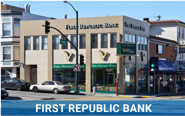
FIRST REPUBLIC BANK