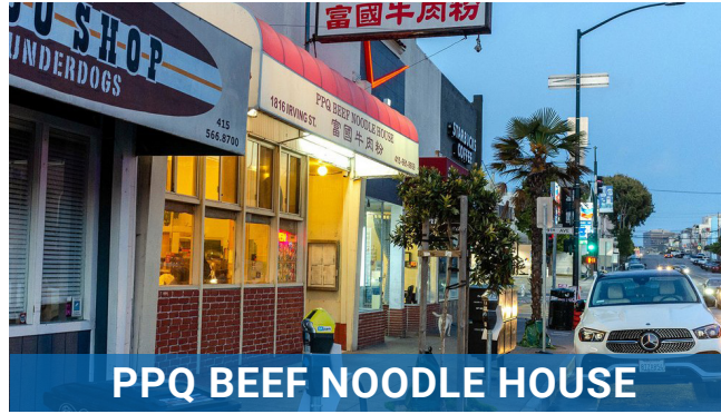
PPQ BEEF NOODLE HOUSE