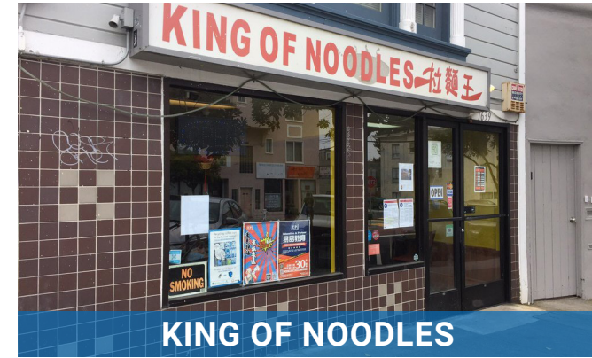
KING OF NOODLES