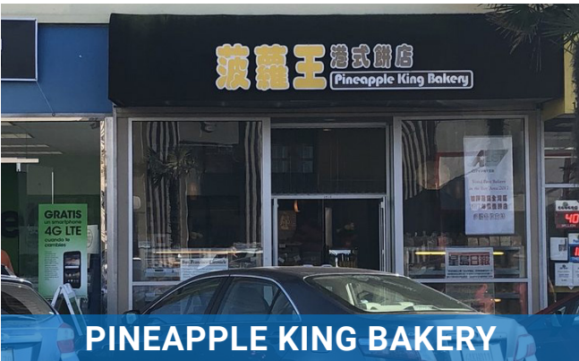
PINEAPPLE KING BAKERY