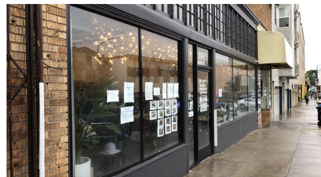
THE GAME PARLOUR