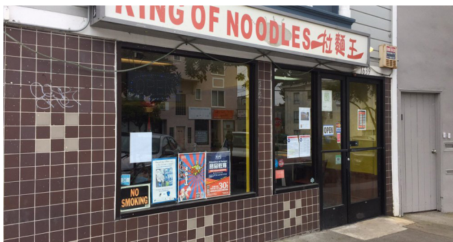
KING OF NOODLES