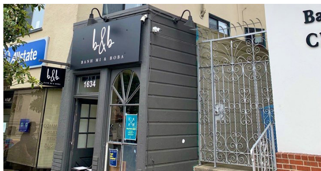
B & B - BANH MI & BOBA