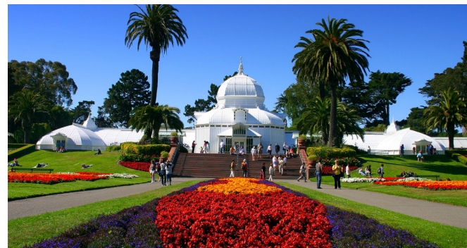
GOLDEN GATE PARK