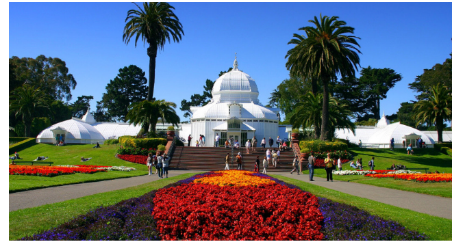
GOLDEN GATE PARK