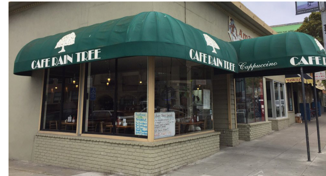
CAFE RAIN TREE