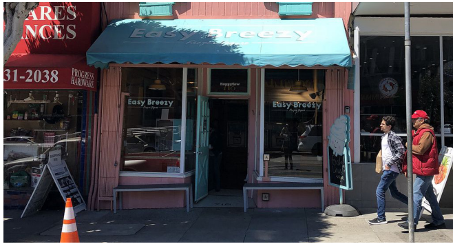
EASY BREEZY FROZEN YOGURT