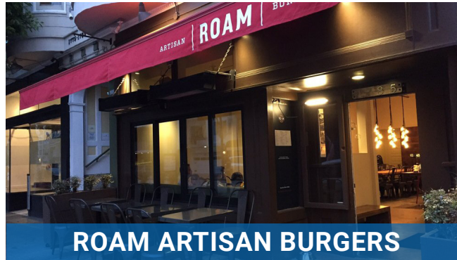
ROAM ARTISAN BURGERS