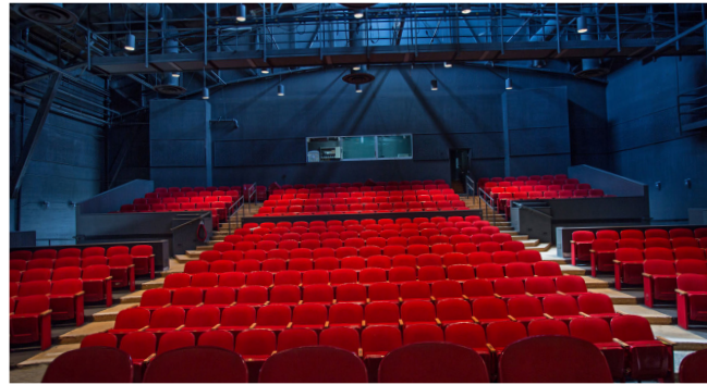
ROSS DRESS FOR LESS