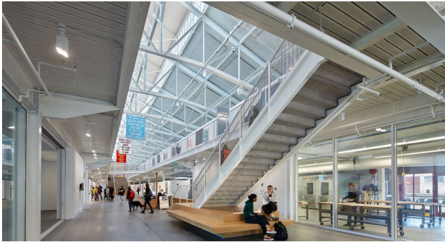
SAN FRANCISCO ART INSTITUTE