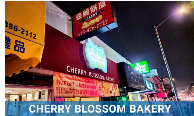
CHERRY BLOSSOM BAKERY