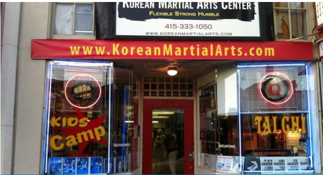
KOREAN MARTIAL ARTS CENTER