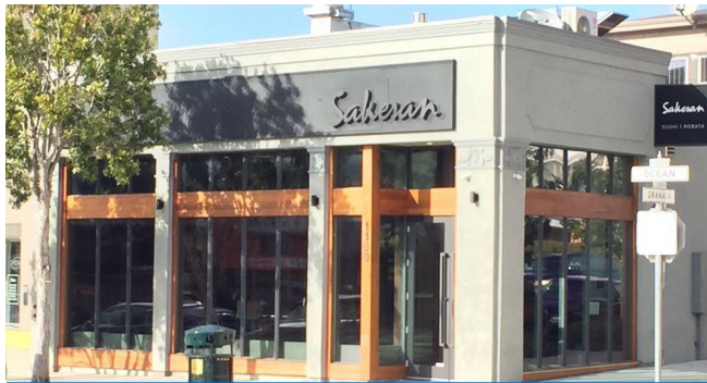
SAKESAN SUSHI & ROBATA