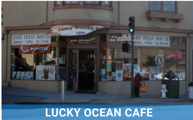
LUCKY OCEAN CAFE