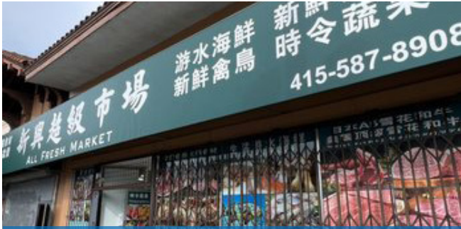
ALL FRESH MARKET