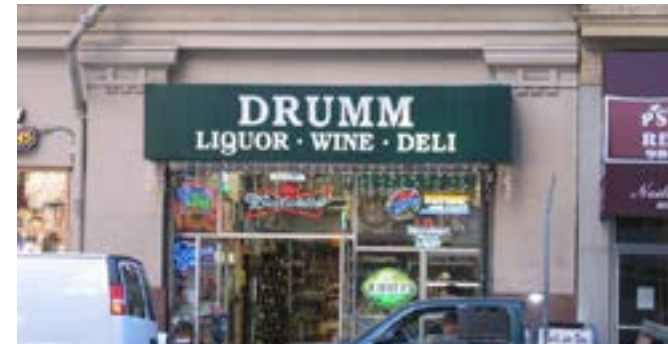
DRUMM LIQUOR & DELI