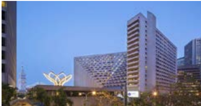
HYATT REGENCY (OVER 820 ROOMS)