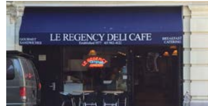
LE REGENCY DELI