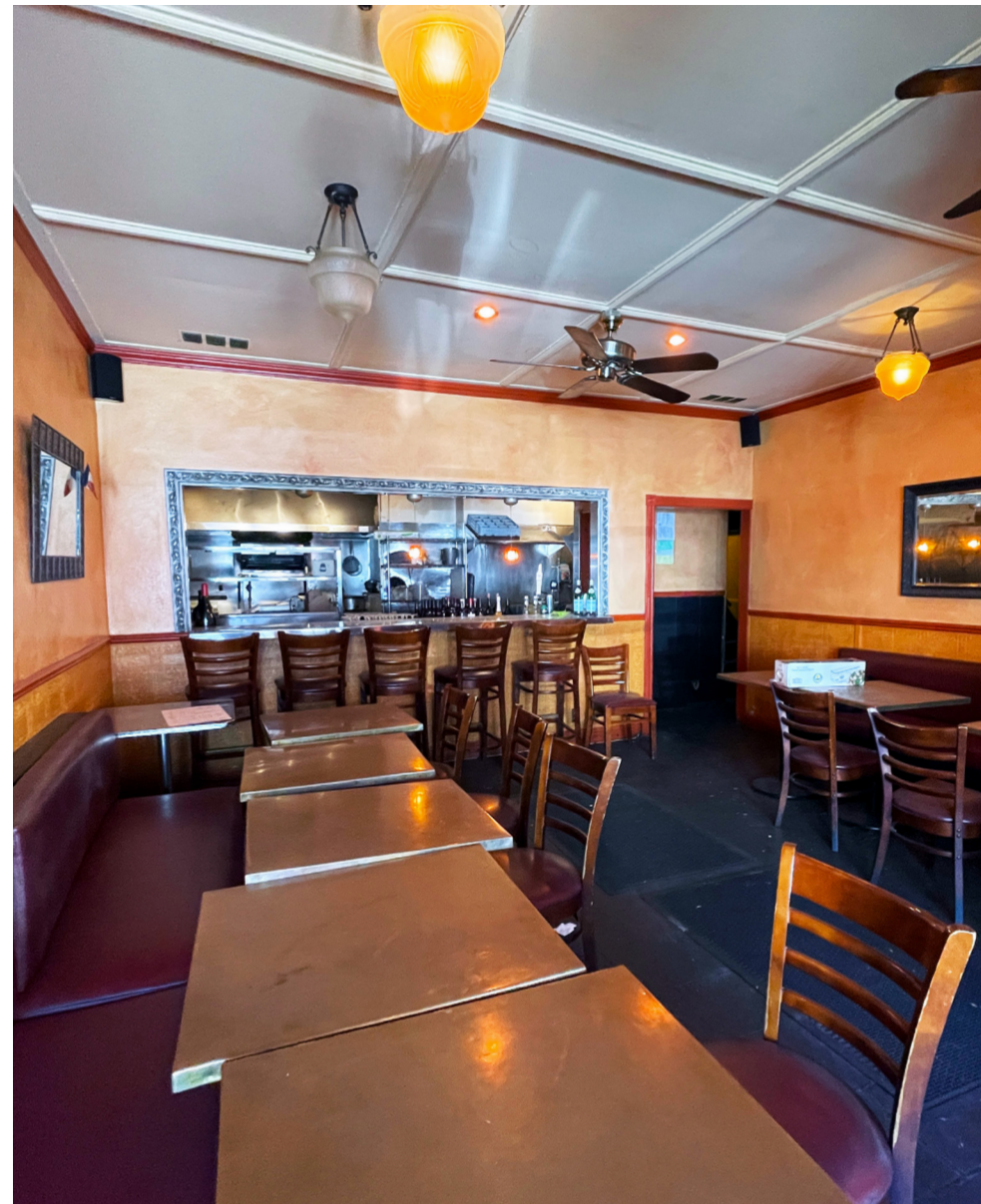
*Photo was taken when the prior tenant occupied the space and does not depict existing conditions.