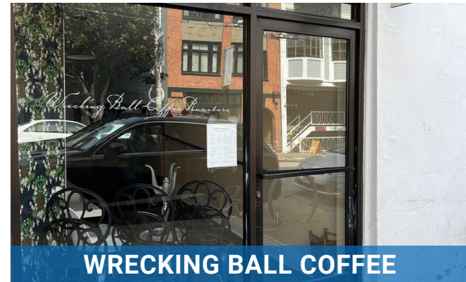
WRECKING BALL COFFEE