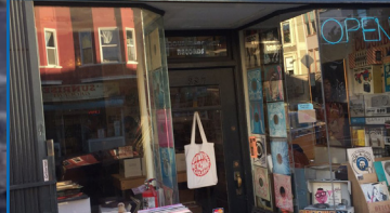
Groove Merchant Records