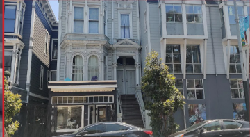
631 Haight Street