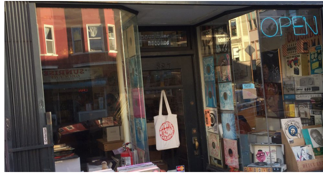
GROOVE MERCHANT RECORDS